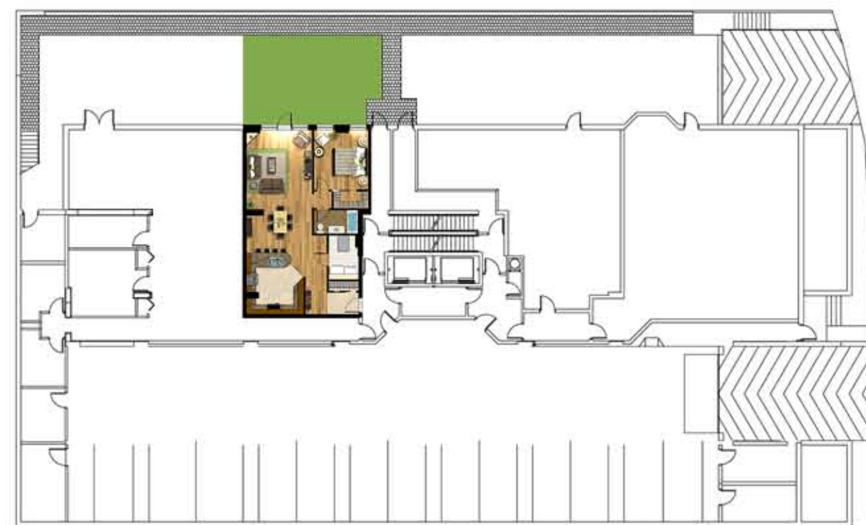
Niveau sous-sol / Level