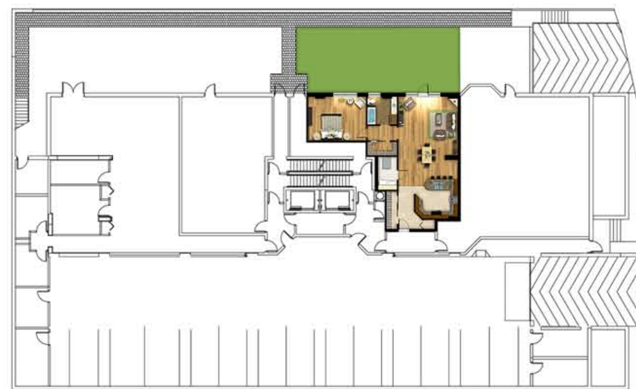
Niveau sous-sol / Level